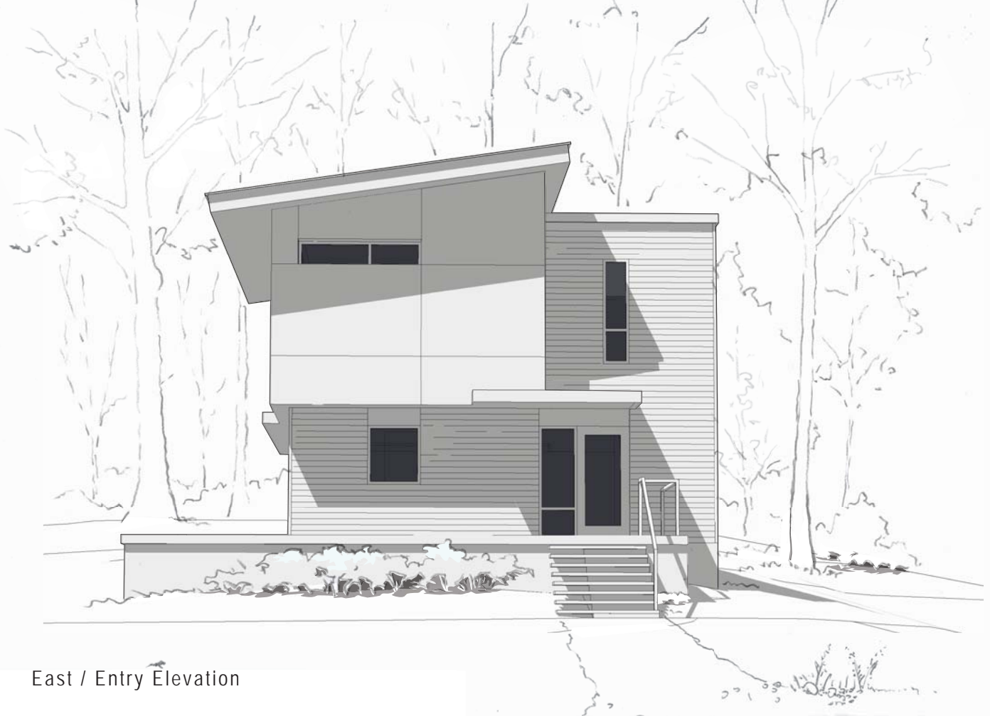
East / Entry Elevation